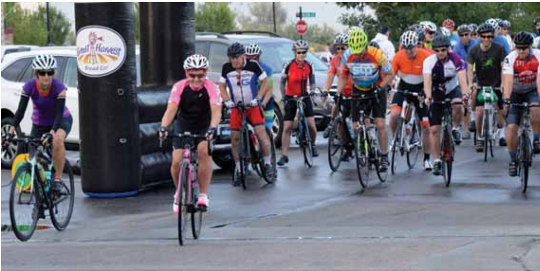
Starting line of the 2017 HeART of Idaho Century Ride.