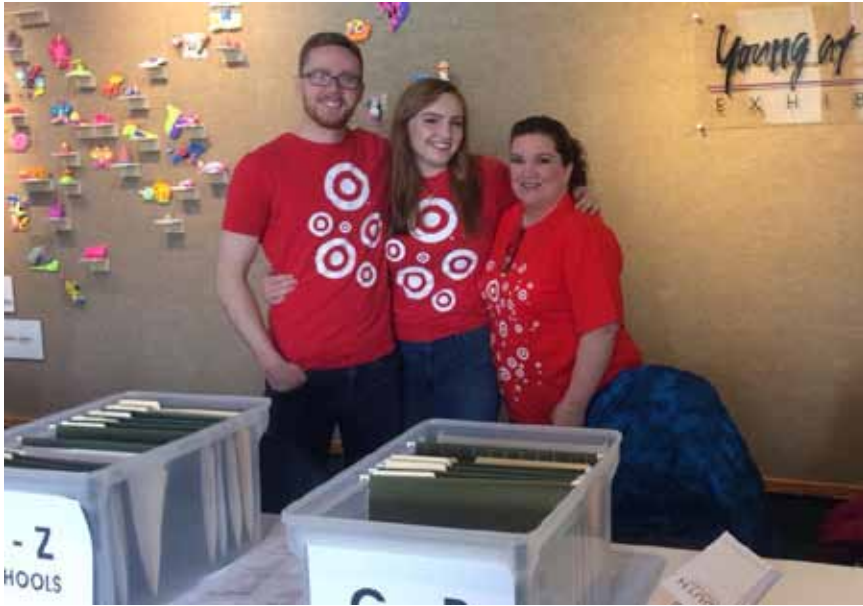
Target volunteers helping out at Young at Art Family Day.

TAM volunteers, the heart of the museum, provide countless hours of donated time and offset thousands of dollars in labor costs. From exhibits to education, to building maintenance and fundraisers, our volunteers provide the manpower that helps us fulfill our mission. Our volunteers greet visitors, make sales in the gift shop, help plan and hang exhibits, assist with education outreach tours and Family Day art activities, and provide support for our fundraisers by directing traffic, delivering goods, setting up signs, repairing bicycles, helping with auctions and much more. They even help maintain TAM's beautiful water features and sensory gardens.