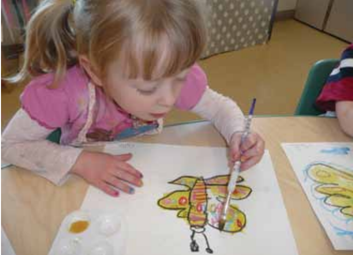
Head Start in Idaho Falls, Idaho