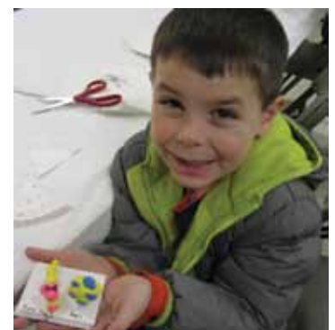
Young at Art Family Day, March 2018

Adult classes engage new and emerging artists, allowing beginning students to develop their own artistic voice and advance in techniques. Intermediate and advanced classes and workshops help established artists connect with new approaches and refine their skills.